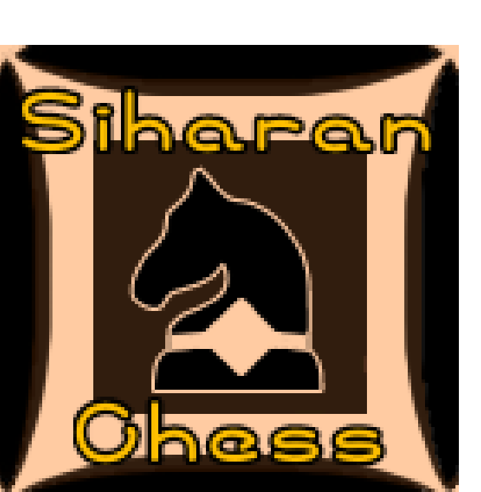
siwongjeppsquare.we @2022=2024 Simon E. Jepps